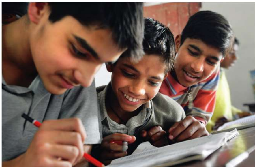
From Doon School to Downing College?